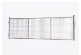
Marbo Gate — 4.0m GALVANISED FINISH / 1.2m high