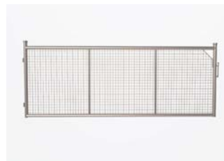
Marbo Gate — 3.6m GALVANISED FINISH / 1.2m high