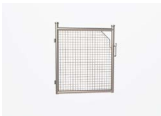
Marbo Gate — 1.2m GALVANISED FINISH / 1.2m high