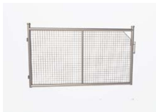
Marbo Gate — 2.4m GALVANISED FINISH / 1.2m high