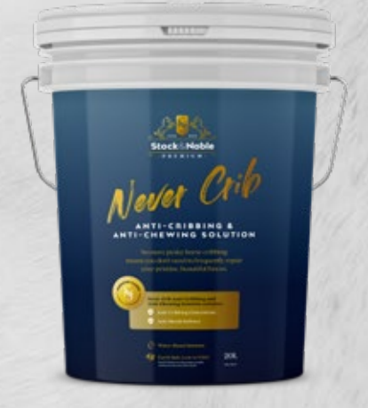
Never Crib ANTI-CRIBBING & ANTI-CHEWING SOLUTION