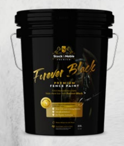
Forever Black PREMIUM FENCE PAINT