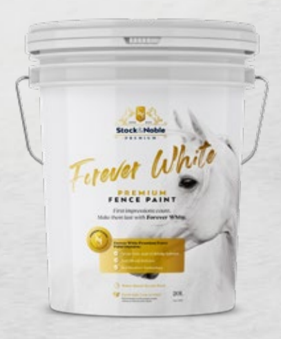
Forever White PREMIUM FENCE PAINT