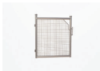
Marbo Gate — 1.2m GALVANISED FINISH / 1.2m high