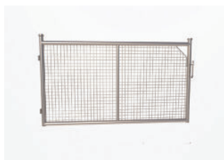
Marbo Gate — 2.4m GALVANISED FINISH / 1.2m high