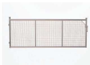
Marbo Gate — 3.6m GALVANISED FINISH / 1.2m high